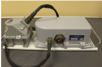
Dual Enclosure ATACNAV-HA (External IMU)